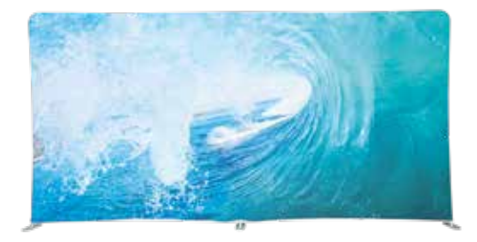
Stage 18 1.8m wide straight stand from £305 FDSCHOFC

Stage 46 4.6m wide straight stand from £659 FDSSAOFC