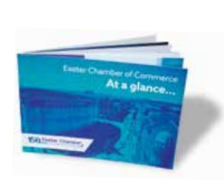
Landscape A5 210x148mm pages