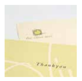
Pharaoh Stationery 120gsm subtle cream. 250 from £60.30 STPHICSOD