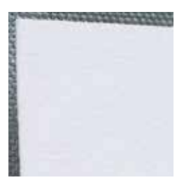
Conqueror Stationery 120gsm Stonemarque texture. 250 from £63 stcacsdd