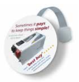
Wobblers 500 from £207 WOBA7S