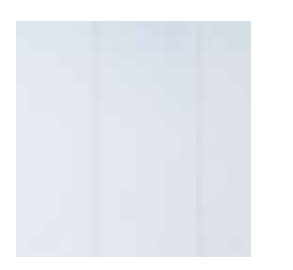
Praxis Stationery 100gsm Micro-laid texture. 250 from £59.40 stprcsod