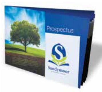
Landscape A4 297x210mm pages