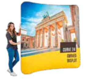
Curve 24 2.4m wide curved stand from £325 FDSBLOFC

Curve 30 3.0m wide curved stand from £384 FDSRCOFC